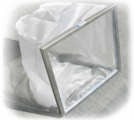
Midgie Pocket Bags